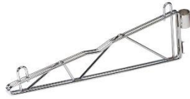
CB Post Cantilever Single Arm