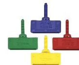
PS-LH3 Hanging Label Tag. Fits 1-3/8" x 3" adhesive label. Available in 5 colors (pack of 25)