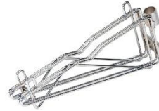
DCB Post Cantilever Double Arm