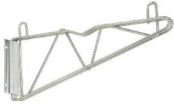
DWB Direct Wall Cantilever Arm