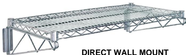
DIRECT WALL MOUNT CANTILEVER