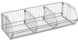
BC Wire Shelf Basket. Allows high visibility and quick accessibility. (Refer to Accessories Spec Sheet for options)