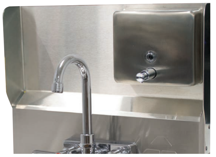
Unit mounts to Existing Back Splash of Hand Sink (Fits Sinks with 10" x 14" Sink Bowls)

(For Advance Tabco Hand Sinks With 10" x 14" Sink Bowls Only)