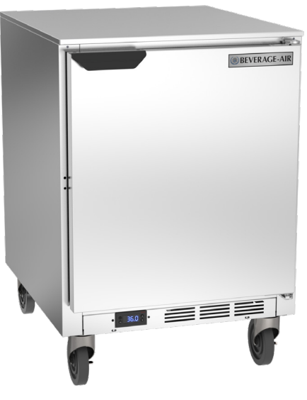
Note: Shown with optional full electronic control