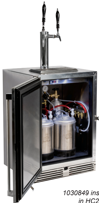
1030849 installed in HC24 unit