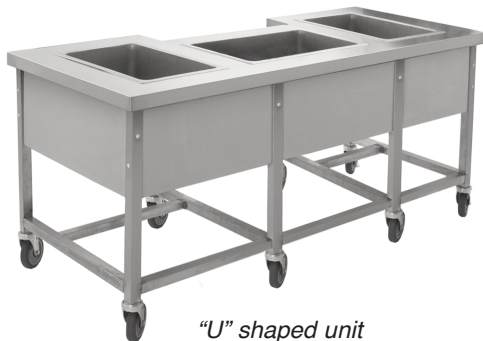
"U" shaped unit

Eagle Director's Choice® Hot Food Service Counter, model _____ . Top to be 16/304 stainless steel turned down on all sides. Fully welded 1½" square stainless steel tubular frame with type 304 aprons on all sides. Sealed wells accept 12" x 20" food pans, and feature individual thermostatic controls. Single or three phase, wired to a 10' cord and plug. Fully mobile with 5" poly tread casters, half with brake.