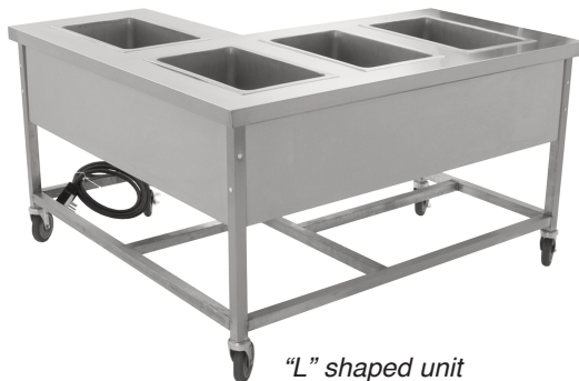
"L" shaped unit