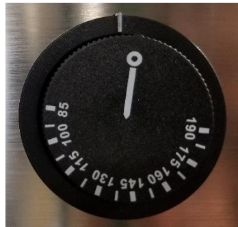
Manual Temperature Control