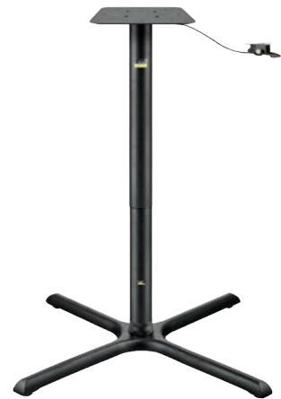
KX36 Height-Adjustable (Pneumatic Post) CT2066