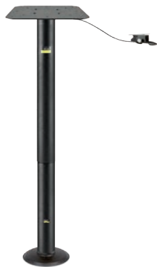
Bolt-Down Base with Pneumatic Post CT7000

Bolts securely to the floor, providing a solid base for your customers.