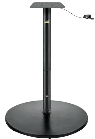
UR30 Height-Adjustable (Pneumatic Post) CT3027