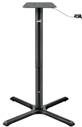
KX30 Height-Adjustable (Pneumatic Post) CT2065