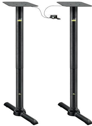
KT22 Height-Adjustable (Pneumatic Post) CT2067

Get all the benefits of having FLAT® technology under the base combined with the great possibilities that our height-adjusting post provides.