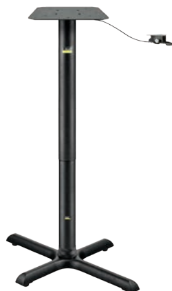
KX2230 Height-Adjustable (Pneumatic Post) CT2069