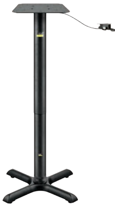
KX22 Height-Adjustable (Pneumatic Post) CT2064