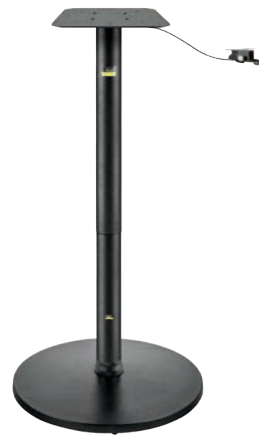
UR22 Height-Adjustable (Pneumatic Post) CT3026