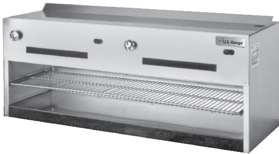
Model shown IRCMA-48