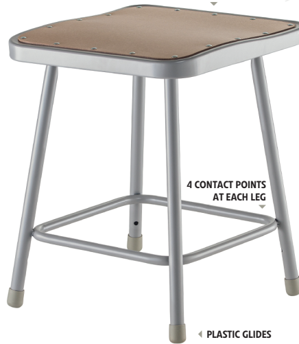
MODEL 6318 SHOWN