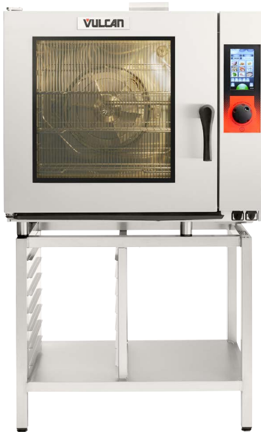
Model TCM61G Shown on optional stand