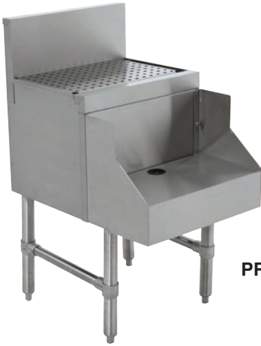
PRDB-19 Series 25" Wide Units