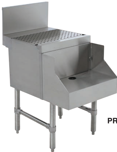
PRDB-24 Series 30" Wide Units