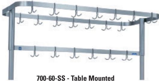
700-60-SS - Table Mounted