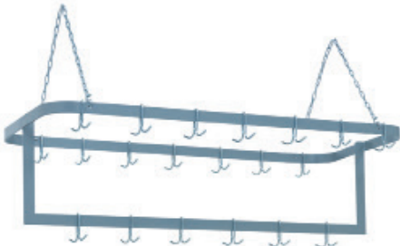
712-60-PG - Ceiling Hung