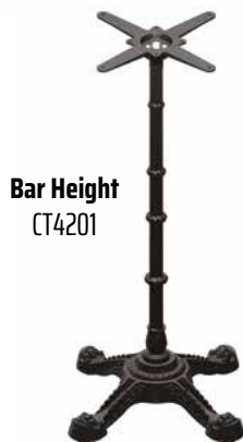
Bar Height CT4201

WARNING: Exceeding maximum recommended table top size and weight will reduce functionality and performance of the technology. See Table Top Size Guide for more info or consult with your FLAT representative for further information or alternative configurations.