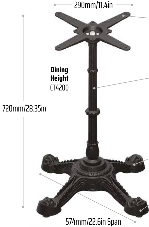
Dining Height CT4200

PX23 ♦ Our ornate design provides a solid footing for a range of tops. With elegant detailing, this base is available in dining and bar height configurations.