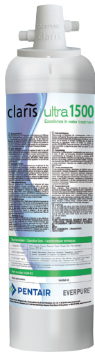
Head sold separately.

Claris Ultra 1500-XL Filter Cartridge: EV4339-83