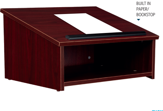
SHOWN IN →