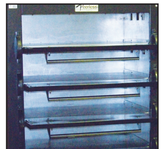
Adjustable Dampers at each deck