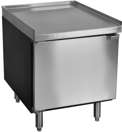
MS20 with optional legs