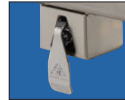
Knee Valves Included On All "KV" Models