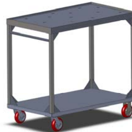
TT Insulated Tray Transport