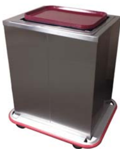
Enclosed cabinet—lift entire lowerator assembly out of cabinet to access the springs