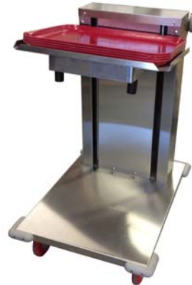
CTD Enclosed Tray Dispenser