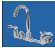
"-F" Series Sink Includes K-159 Gooseneck Faucets