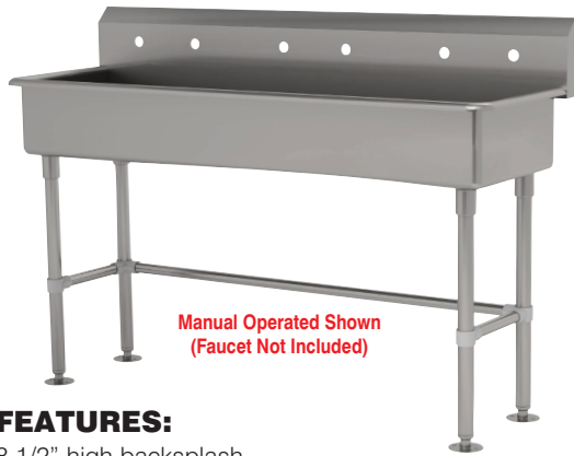
Manual Operated Shown (Faucet Not Included)