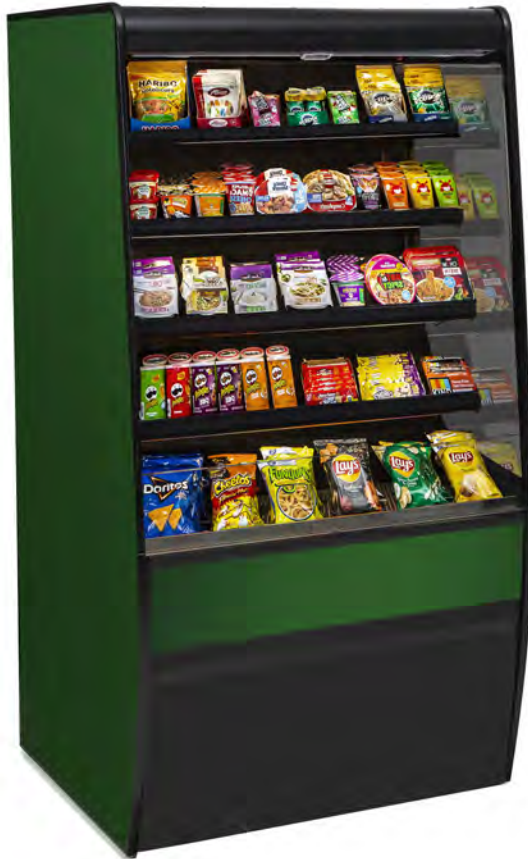
Model VNSS3678C Shown with Options

Designed with impulse sales in mind. Get maximum return from an attention-grabbing merchandiser and increase profits.