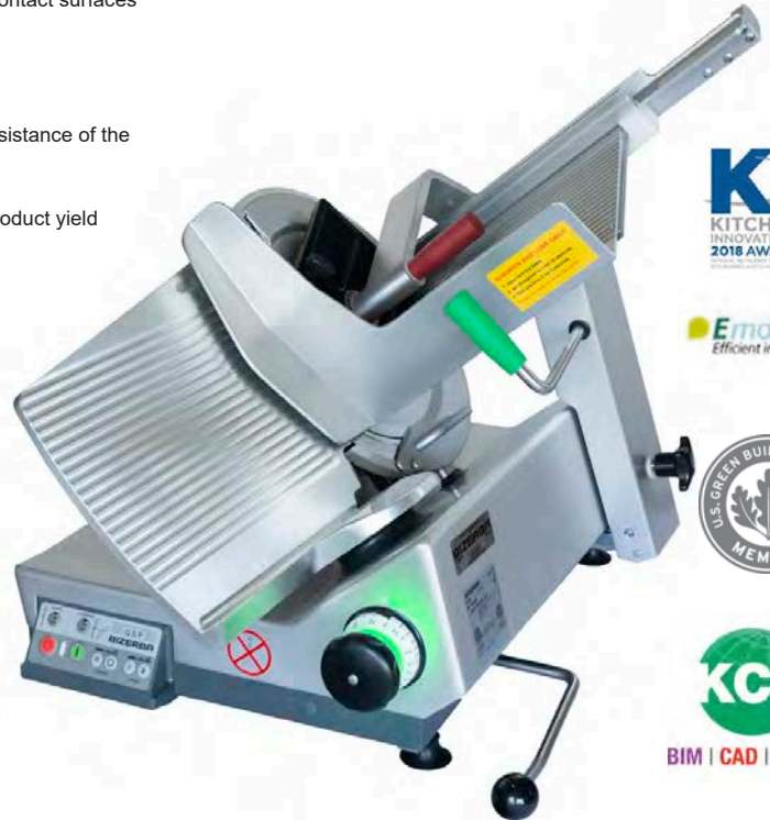
Gauge plate closed, safe for cleaning - green.