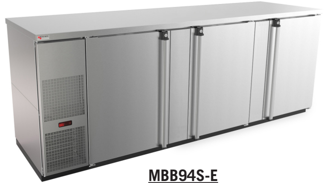
MBB94S-E Stainless Steel