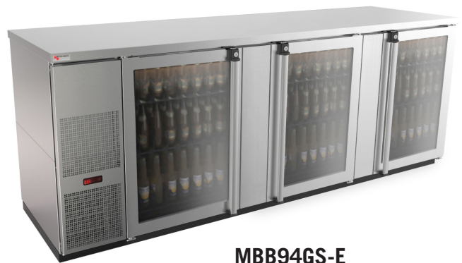
MBB94GS-E Stainless Steel with Glass Doors