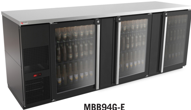
MBB94G-E Black with Glass Doors