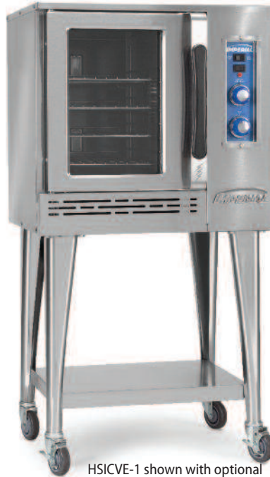
HSICVE-1 shown with optional bottom shelf and casters

Oven interior is porcelainized for easy cleaning.