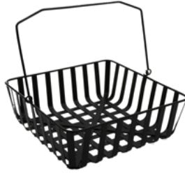
WB-560-BK Square Basket 12" L x 4.25" H 16 ea