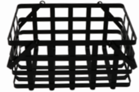
WB-567-BK Rectangular Basket w/ Handles 12" L x 7.75" W x 6.25" H 16 ea