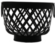
WB-569-BK Round Basket w/ Handles 9.5" Dia. x 7.25" H 16 ea