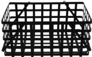
WB-566-BK Rectangular Basket w/ Handles 18" L x 11.5" W x 8.5" H 8 ea