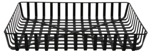
WB-565-BK Rectangular Basket 24" L x 18" W x 3.75" H 8 ea