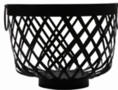
WB-568-BK Round Basket w/ Handles 11.5" Dia. x 8.75" H 12 ea