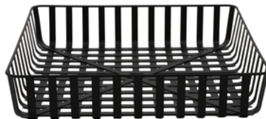
WB-564-BK Square Basket 18" L x 3.75" H 8 ea