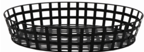
WB-563-BK Oval Basket 24" L x 18" W x 4.5" H 8 ea