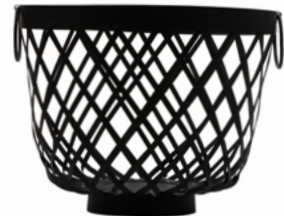
WB-570-BK Round Basket w/ Handles 12.5" Dia. x 9.75" H 6 ea