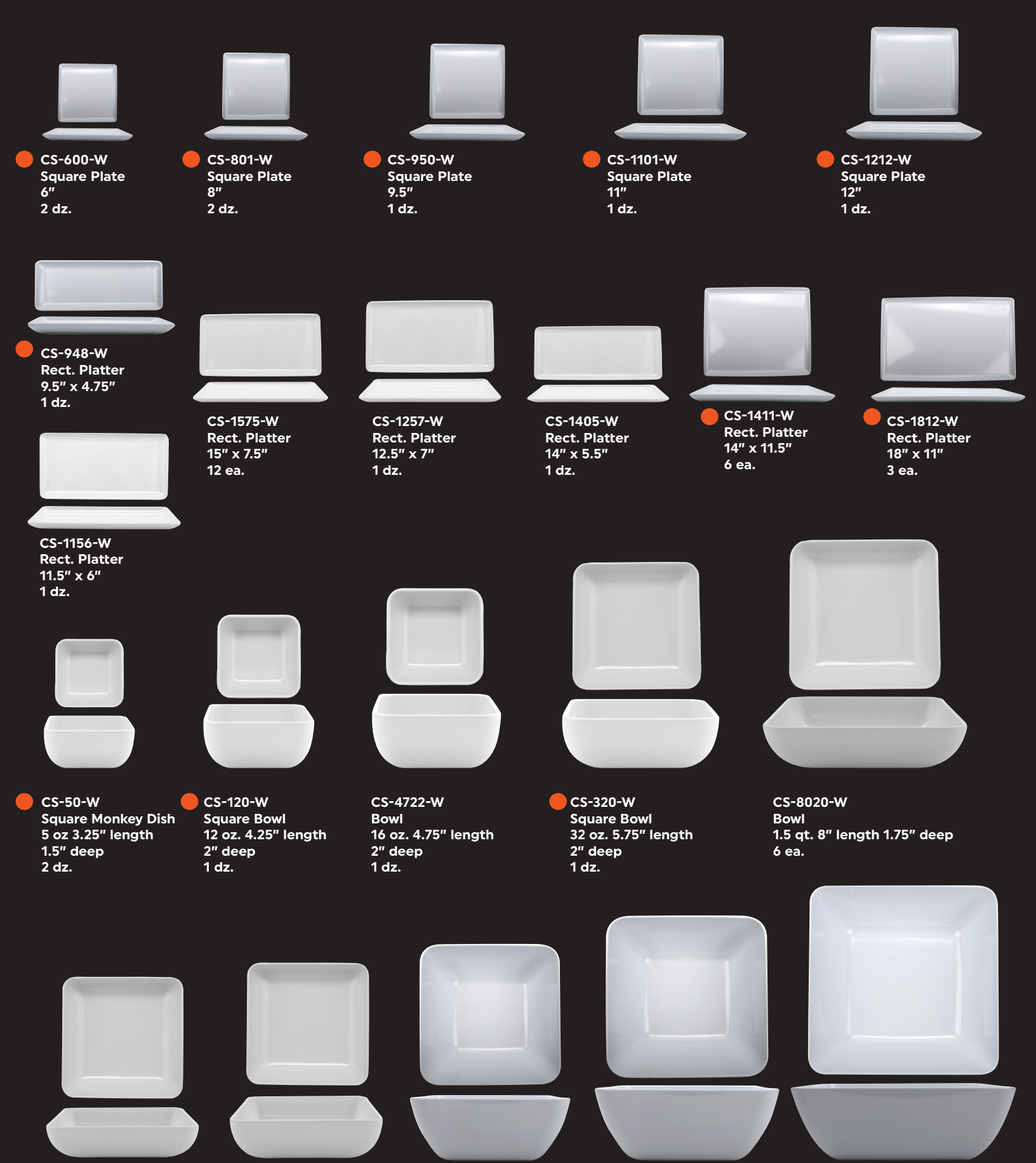
CS-9236-W Bowl 2.3 qt. 9" length 2" deep 6 ea.