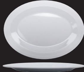
● PT-183-MN-W 18" x 13" Oval Platter