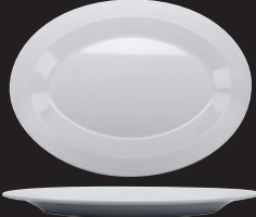
● PT-151-MN-W 15" x 11" Oval Plate