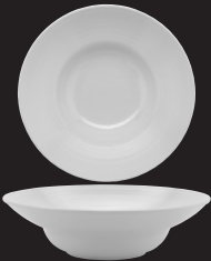
B-12-MN-W 12 oz Bowl