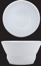
● B-5-MN-W 5 oz Monkey Dish