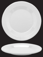
PT-6-MN-W 6.5" Plate