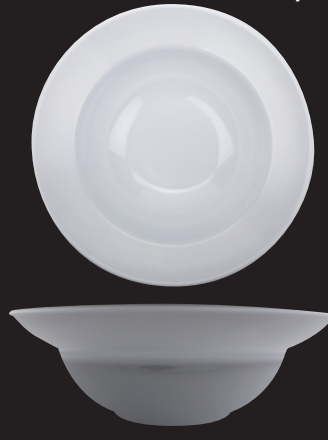
● B-192-MN-W 6 qt Serving Bowl