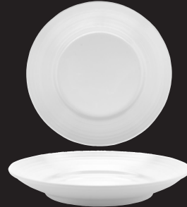
B-32-MN-W 1 qt Entrée Bowl