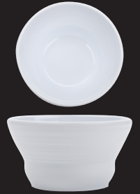
● B-14-MN-W 16 oz Soup/Cereal Bowl