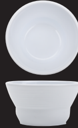
B-10-MN-W 8 oz Bowl