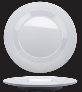
● PT-12-MN-W 12.5" Plate