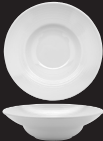
B-16-MN-W 16 oz Bowl