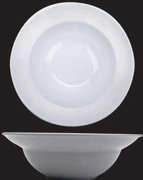
● B-64-MN-W 2 qt Serving Bowl