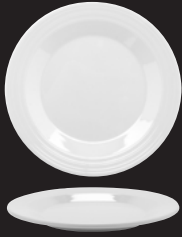
PT-7-MN-W 7.5" Plate