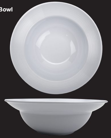
● B-352-MN-W 11 qt Serving Bowl