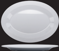
PT-129-MN-W 12" x 9" Oval Plate