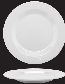
PT-10-MN-W 10.5" Plate