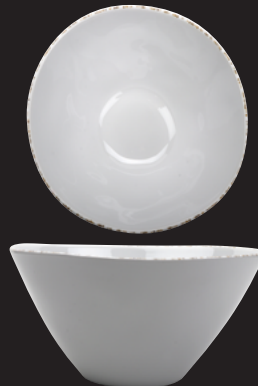
B-193-UM Round Bowl 6 qt. 13" dia. 5.5" deep 3 ea.