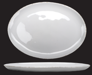
CS-1813-UM Oval Platter 18" x 13" 3 ea.