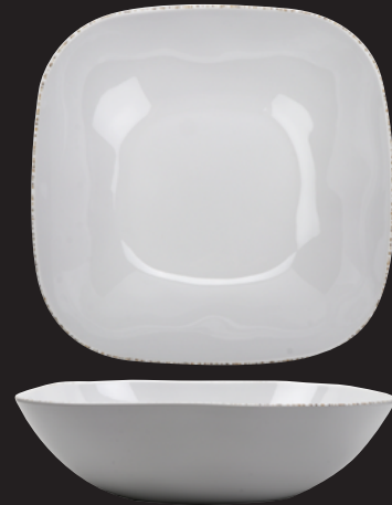
SB-410-UM Square Bowl 12.8 qt. 16.75" length 4.5" deep 3 ea.