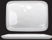
CS-119-UM Platter 12.75" x 9.5" 1 dz.