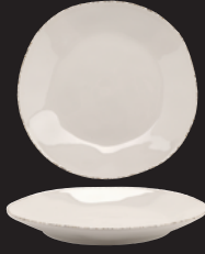
B-43-UM Round Bowl 28 oz. 10.75" dia. 1" deep 1 dz.