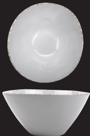
B-66-UM Round Bowl 2 qt. 9" dia. 4" deep 6 ea.