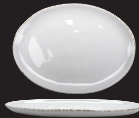
CS-1511-UM Oval Platter 15" x 11" 6 ea.