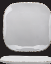
SCS-9-UM Square Plate 9.5" 1 dz.