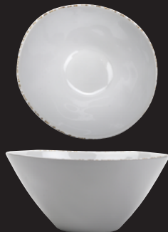
B-130-UM Round Bowl 4 qt. 11.25" dia. 5" deep 3 ea.