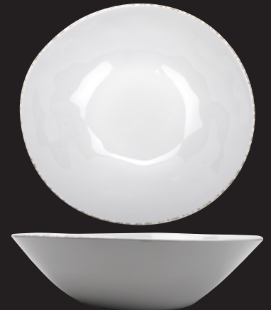
B-353-UM Round Bowl 11 qt. 18" dia. 4.5" deep 3 ea.