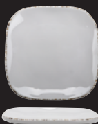
SCS-6-UM Square Plate 6" 2 dz.