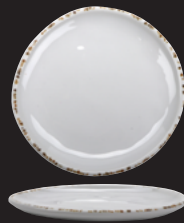
CS-10-UM Round Plate 10.5" 1 dz.