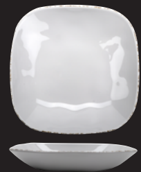
SB-48-UM Square Bowl 1.5 qt. 10.25" length 1.75" deep 1 dz.