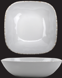
SB-80-UM Square Bowl 2.5 qt. 10" length 2.5" deep 6 ea.