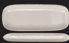
CS-146-UM Platter 14" x 5.5" 12 ea.