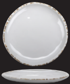
CS-7-UM Round Plate 7" 1 dz.