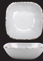
SB-14-UM Square Bowl 14 oz. 6" length 1.5" deep 2 dz.