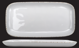
CS-1576-UM Display Tray 15" x 7.5" 12 ea.