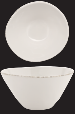
B-22-UM Round Bowl 22 oz. 6.25" dia. 2.75" deep 1 dz.