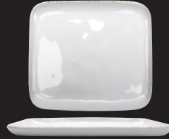
CS-1412-UM Platter 14" x 11.5" 6 ea.