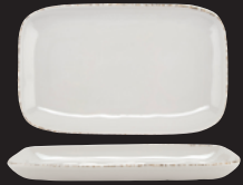
CS-117-UM Platter 12" x 7.5" 1 dz.