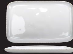
CS-1814-UM Display Tray 18" x 11" 3 ea.