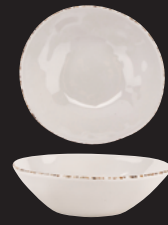
B-18-UM Round Bowl 16 oz. 7" dia. 1.75" deep 1 dz.