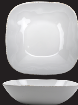
SB-182-UM Square Bowl 5.7 qt. 13" length 3.5" deep 3 ea.