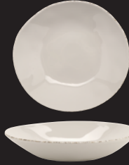
B-42-UM Round Bowl 1.3 qt. 10" dia. 1.75" deep 1 dz.