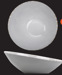
B-792-UM Cascading Bowl 24 oz. 9.25" dia. 2.75" deep (front) 4.75" deep (back) 1 dz.